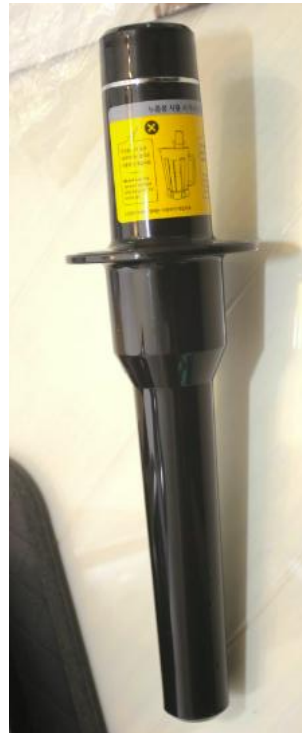
<Temperature Check Stick>